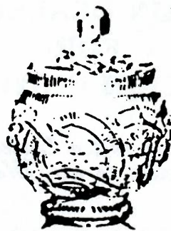
Celtic Centre Piece